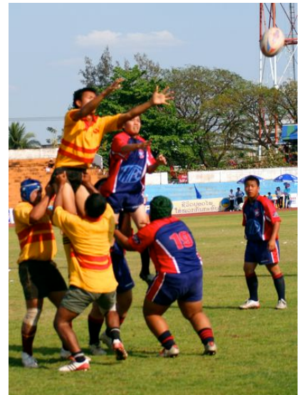
Two Domestic Youth Teams Contest a Line-out