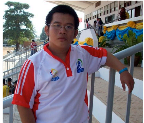
A Lao PDR IRB Official at the SEA Games in December, 2007