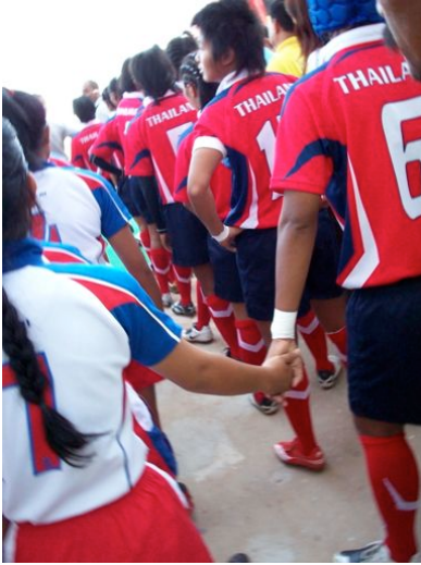
The Lao PDR Women's Sevens Squad Preparing to Play Thailand