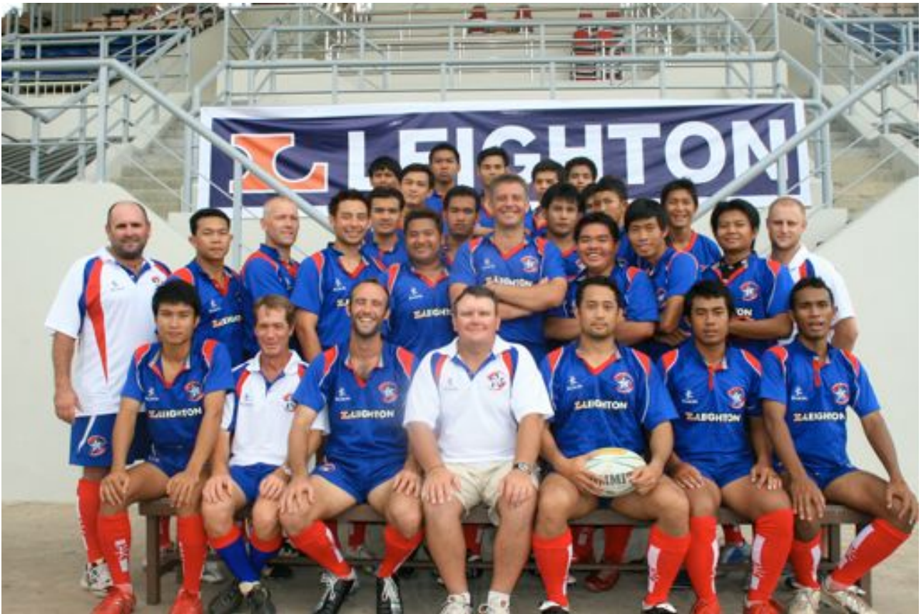
The Lao PDR National Men's XV's Squad in Brunei Darussalam