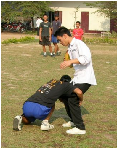
School Boys Work on their Tackling Techniques