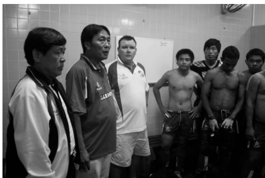
The LRF President and a Member of the National Sports Committee Speak to the Lao Men's National Team

• Working with the Ministry of Labour and Social Welfare to secure insurance for Lao players