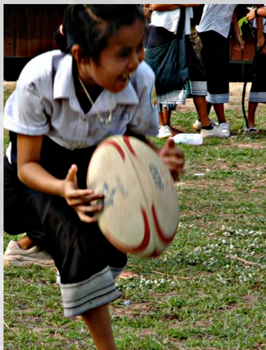
A School Girl in Savannakhet Enjoys Her First Taste of Rugby (left) and Two School Teams Compete in a Line-out in a Vientiane Community Rugby Weekend (right)