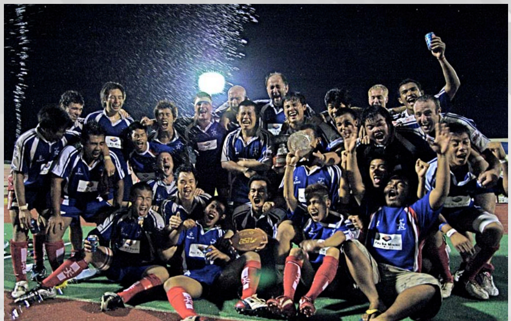
The Lao PDR Men's National Team in Savannakhet Celebrating their Triumph Over Cambodia and Brunei to Win their First Ever Asian 5 Nations Divisional Title