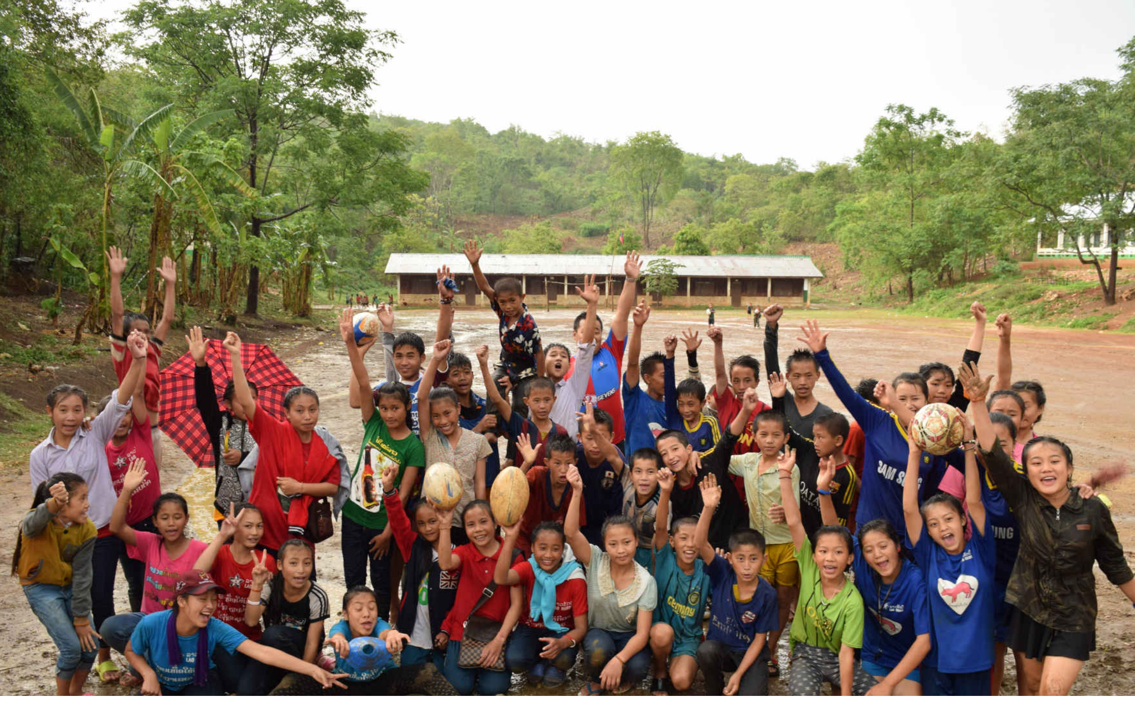
ACCOMPLISHMENTS IN 2015